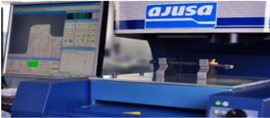
Illustration 1 Machine Vision Measurement

The search of more efficient engines, as well as the commitment to the environment, have led to stronger requirements when it comes to manufacture sealing gaskets, because an incorrect design can make the efficiency of the vehicle drop. Therefore if it is necessary for a manufacturer like Ajusa to use the latest technological tools regarding the design and verification of the product.