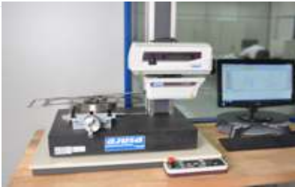
Illustration 3 Profile Measurement

Another measurement and verification tool is the profilometer, which ensures a higher precision process where the gasket seals, and with this tool we can study the morphology in the embossings made in the metallic gaskets, which is the path the market is currently following, where slight changes in the embossing angles values, heights and morphology can make the gasket performance noticeably change.