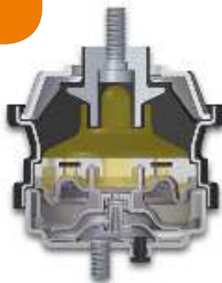
Hydraulic engine mounts