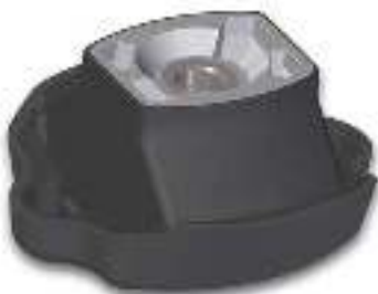
Full-rubber engine mounts

MEYLE-ORIGINAL engine mounts provide greater comfort when driving!