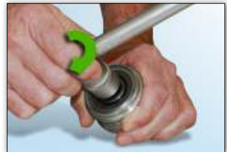
Image 5: The tool can be continuously turned in a clockwise direction with slight resistance.