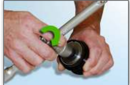
Image 7: The tool can be continuously turned in a clockwise direction with slight resistance.

Appropriate spare parts can be found in our on-line catalogue at www.Schaeffler-Aftermarket.com or in RepXpert at www.RepXpert.com .