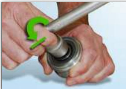
Image 4: The tool jams immediately and cannot be turned when moved in an anti-clockwise direction.