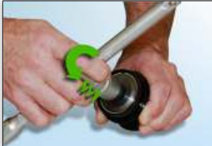
Image 6: You will notice an increasing spring force when the tool is moved in an anti-clockwise direction.