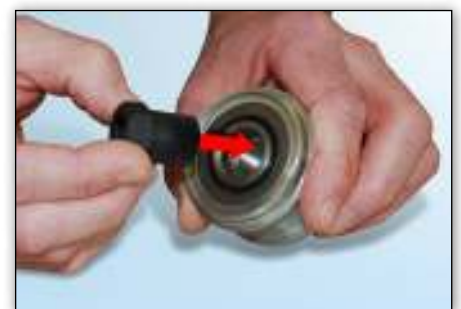
Image 3: The corresponding adapter is inserted into the overrunning pulley.