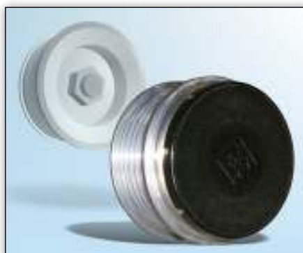
Image 2: A protective cover must be provided with OAPs and OADs to protect them from dirt.

The corresponding adapter must be selected from the tool kit when removing or testing the OAPs or OADs.