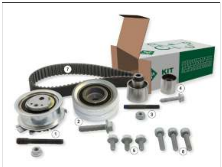
Image 1: INA tensioner pulley kit 530 0550 10

All components in the timing assembly are designed to achieve the same service life and are subject to the same amount of wear.