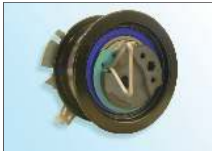
Fig. 1: 531 0565 30 (old version)