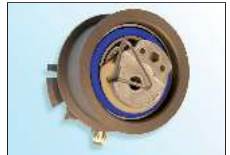
Fig. 2: 531 0565 30 (new version)