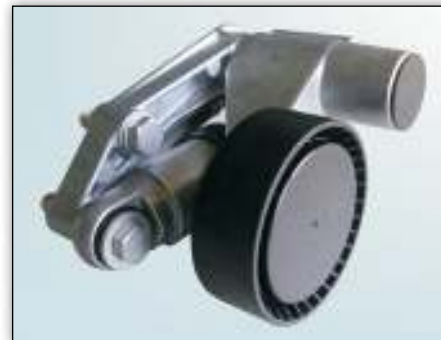
Image 2: 533 0097 10 (hydraulic design)

The mechanical tensioning arm 533 0015 10 (Image 1) in the original equipment has been replaced by a tensioner with hydraulic damping (Image 2).