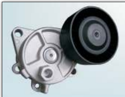
Image 1: 533 0015 10 (mechanical design)

Part Nos.: 533 0015 10 (mech.) 533 0097 10 (hydr.)