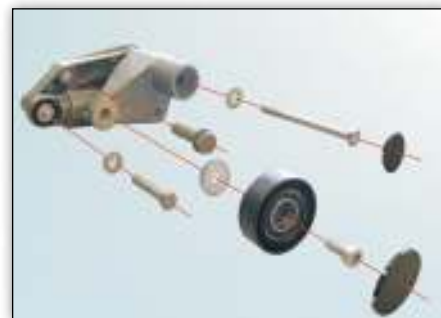
Image 3: 533 0097 10 — Scope of delivery

As an alternative, Schaeffler Automotive Aftermarket offers a conversion kit 533 0097 10 that, in addition to the hydraulic damper, contains all the necessary components required to convert from the mechanical to the hydraulic tensioner (Image 3).