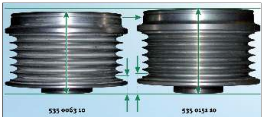
Image 3: Distinguishing between INA over-running alternator pulleys 535 0063 10 (VALEO) and 535 0151 10 (DENSO)