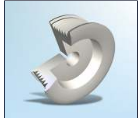
Image 2: Rigid belt pulley

Various designs are used depending on the vehicle, engine and equipment. Please refer to our catalogue to ensure you choose the correct overrunning belt pulley.