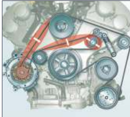
Image 1: Sample assembly drive — Illustration of vibrations caused by the use of a conventional rigid belt pulley on an alternator

As these belt pulleys are exposed to wear in the same manner as tensioner pulleys, deflection pulleys and belts, Schaeffler Automotive Aftermarket recommends replacing the overrunning alternator pulley/the decoupler when replacing the components in the assembly drive.