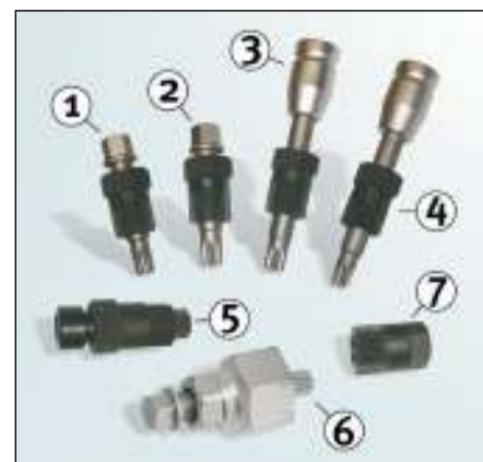
Image 5: Special tools for fitting and removing different overrunning alternator pulleys

An overrunning alternator pulley features an overrunning clutch unit. This enables the alternator to be decoupled from the rotational imbalance on the crankshaft and the effects of the alternator's moment of inertia on the assembly drive and the belt vibrations are significantly reduced as a result. The force within the assembly drive is reduced, and the tensioner, pulleys and belts are subjected to smaller loads and have a longer service life.