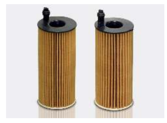
Figure 1: Almost identical oil filter inserts: OX404 on the left and OX813/1 on the right

IMPORTANT! Prior to installation, please check whether you have the correct oil filter insert and ensure where appropriate that a locating tab is visible inside the insert (see figure 2).