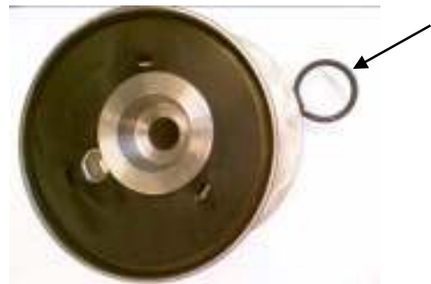
Fig. 2 Pulley design without pin