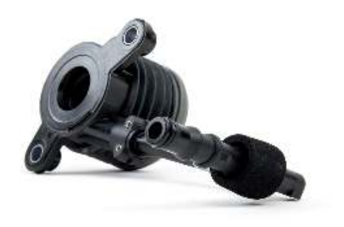
Fig. 2: Concentric slave cylinder with large hydraulic connection

Fig. 1: Concentric slave cylinders with small hydraulic connections